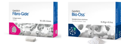
Geistlich products used