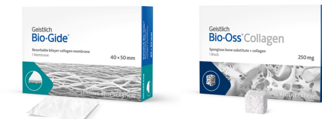
Geistlich products used

Bone volume favors the use of Geistlich Bio-Gide ® in ridge preservation.