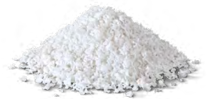
Geistlich Bio-Oss® provides long-term volume stability