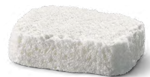
Geistlich Fibro-Gide® provides soft-tissue volume and long-term stability