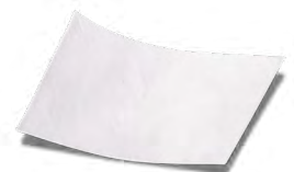
Geistlich Bio-Gide® provides excellent wound stability and graft containment