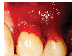
Geistlich Mucograft® in place, adapted to the defect and completely saturated

“Having a thorough knowledge of wound healing can make all of the difference. Every step of the procedure must be planned with the goal of maximizing vascularization of the graft matrix.”