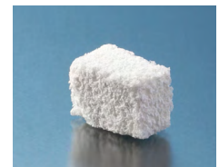
Geistlich Bio-Oss Collagen® provides the versatility needed to treat a wide range of defects

Geistlich Bio-Gide® Shape & Geistlich Bio-Oss Collagen® A winning combination for Minor Bone Augmentation