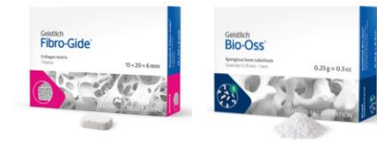
Geistlich products used